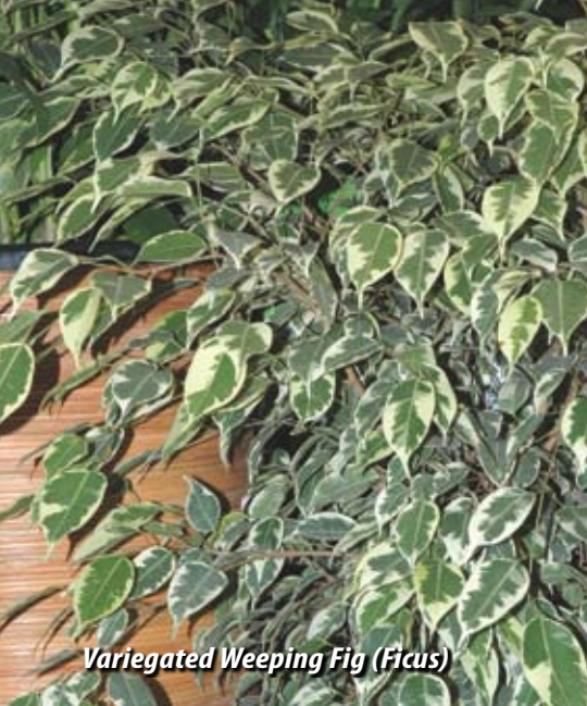
Variegated Weeping Fig (Ficus)